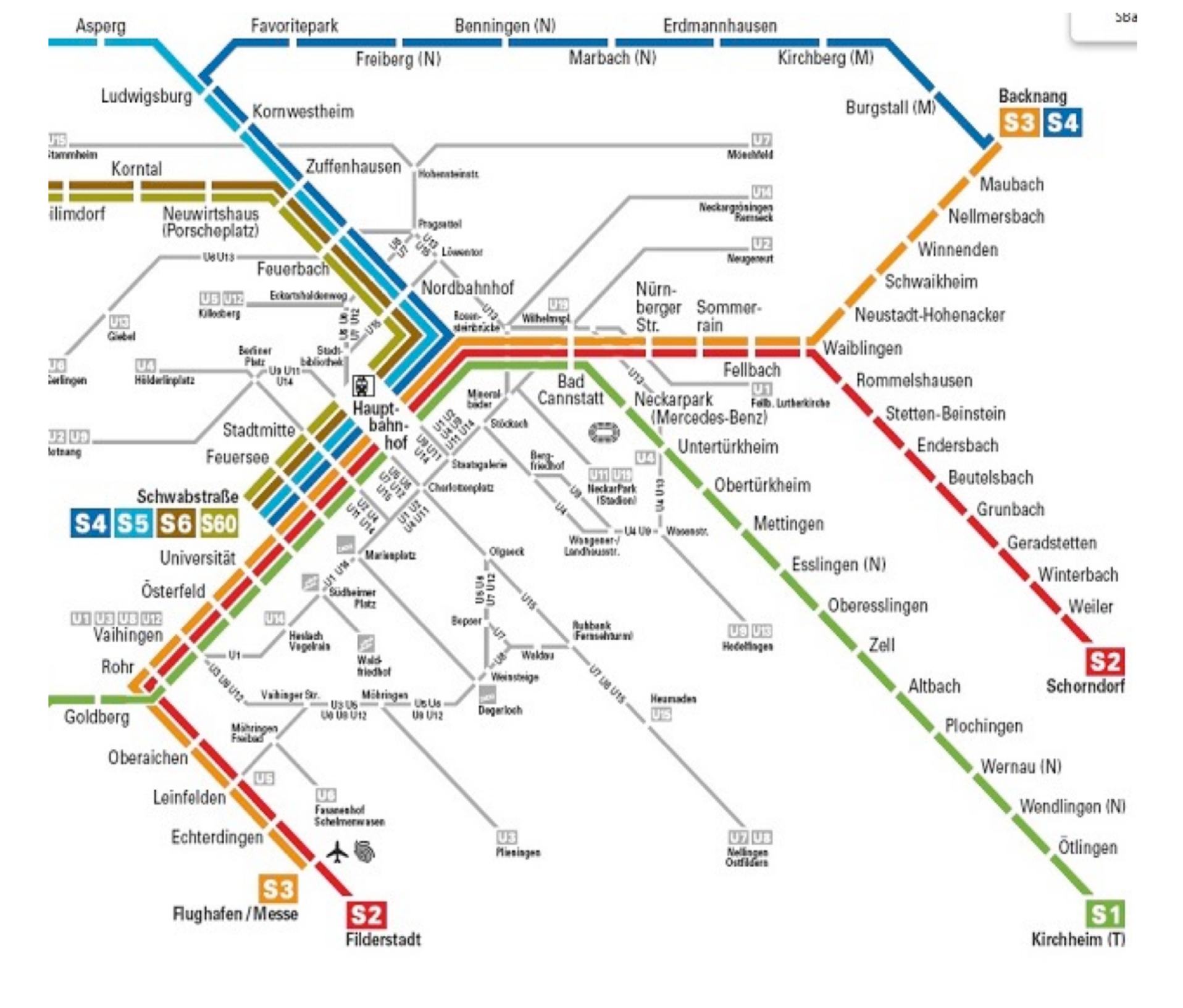
Fig. 1. Fragment of the Schematic Map of S-bahn Run

The airport is located in the south-west of the city. It is possible to access it by electric trains of S2 and S3 lines. S4 line connects the central and northern parts of the city. The run by the S2 line is coordinated with the run by the S4 line. Convenient transfer is at the Schwabstrasse stop. When going towards the airport, the arrival by the S4 line is every hour at :28, :58, and departure to the airport by S2 line from this stop is at :30, :00. The time for transfer is 2 minutes. When going from the airport by S2 line, the arrival at this stop is every hour at :00 and :30, and the departure by the S4 line is at :03 and : 33. The time for transfer in this direction is 3 minutes.