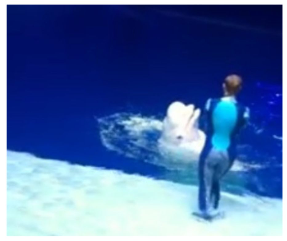
Figure 3 Beluga whale Delphinapterus leucas performs the commands of the coach. The Center for Oceanography and Marine Biology Moskvarium, Moscow. Video frame.

In Russia, interest in capture and demonstration of beluga whales appeared relatively recently, which required the setup of specialized procedures for catching them. Therefore an annual withdrawal from the natural population from several whales to several dozen is made within the framework of this catching (Shpak, 2010, 2012). Working on whales in aquariums and oceanariums, it is necessary to carry out research on the biology of marine fauna, and also to conduct educational work with school children and students (Klumov, Sokolov, 1971). Such experience has been gained by the Center for Oceanography and Marine Biology Moskvarium, which opened in 2015 in Moscow (Fig. 3). Many scientific organizations and educational institutions in Moscow have concluded agreements with this organization on cooperation.