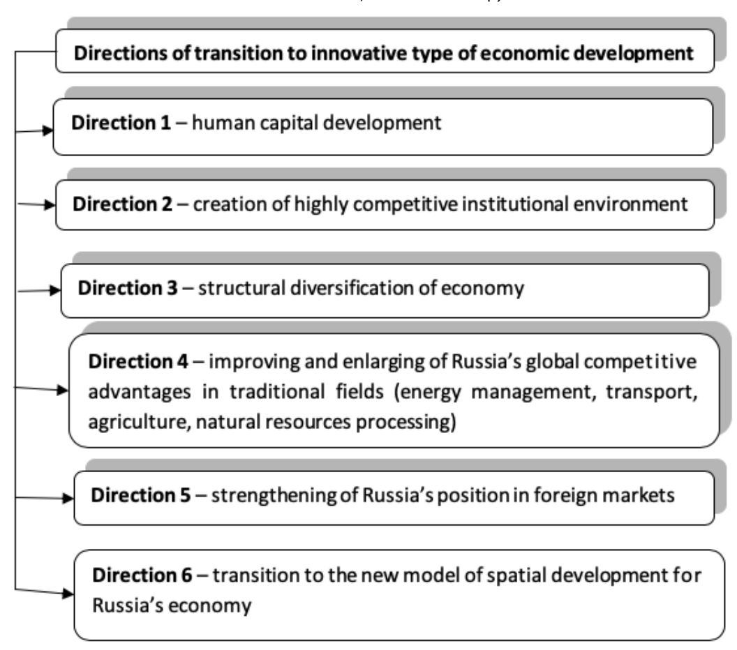
Figure 2 The main strategic directions of innovation development of Russia's economy, compiled by the authors on the basis of data (Order of the Government of the Russian Federation of November 17, 2008 No. 1662-p)

The adopted Strategy for the Innovative Development of the Russian Federation for the period up to 2020 (Order of the Government of the Russian Federation of December 8, 2011 N 2227-p) also defines targets for the further development of the national economy, as well as challenges and threats to Russia's economy in modern conditions. In accordance with this strategy, three options for the development of Russia's economy are identified. The first option provides for inertial development, which implies the absence of significant efforts aimed at innovative development; the emphasis is on maintaining macroeconomic stability, low costs for science and innovation. The second option is based on the local technological competitiveness of using more foreign technologies. The third option implies Russia's achievement of leadership in leading scientific and technical sectors and basic research. Each of the options developed involves the implementation of costs associated with achieving the targets. The third option is the most costly, because it requires more financial resources than the first and second options. However, the economic effect that is potentially possible is much higher than in the first two options. In our opinion, the third variant of development is expedient in those branches of Russia's economy where already now there are leading positions in the world (biomedicine, software, energy management, etc.).